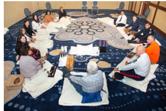
EPS and community members gathered together for the eagle feather pipe ceremony that was held at the River Cree Resort.