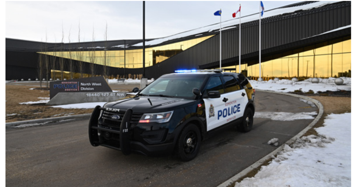
The new Northwest Campus facility is located at 18440 – 127 Street NW in the Goodridge Corners neighbourhood.