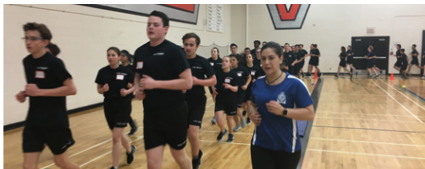
The teens experienced the challenges of police training, and demonstrated the character, enthusiasm, and teamwork necessary to succeed.