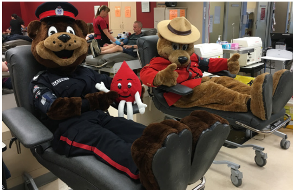
Barney the Bear is ready to roll up his sleeve and donate blood on behalf of the EPS.

2018 Results: 2,329 mental health hospital transfers (0.7% increase y/y)