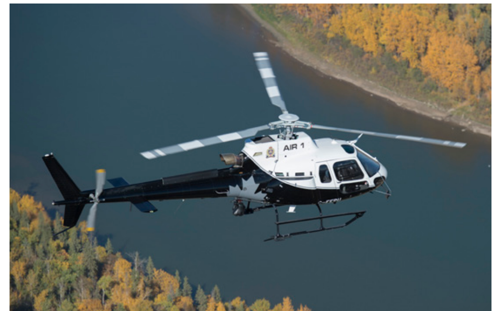
The Honourable Shaye Anderson, Minister of Municipal Affairs, Acting Chief Greg Preston, and Deputy Mayor Mohinder Banga unveiled the new helicopter in the EPS Flight Operations hangar at Villeneuve Airport on Feb. 23, 2018.