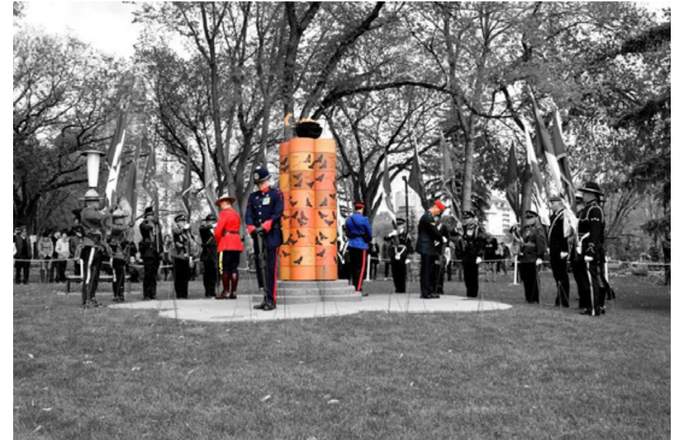
Hundreds of people gathered in Edmonton on Sept. 30 for the 2018 Police and Peace Officers Memorial. Police and peace officers from across the province marched to the lawn of the Alberta Legislature for the ceremony, which honoured officers who have lost their lives in active service in the province.

EPS's Police Misconduct Rate spiked in 2018, in part due to a policy change that impacts how complaints are counted. Previously, repeated traffic violations by sworn members were investigated and disciplined directly by the reporting supervisor; these incidents are now investigated by our Professional Standards Branch, which now counts as an internal complaint.