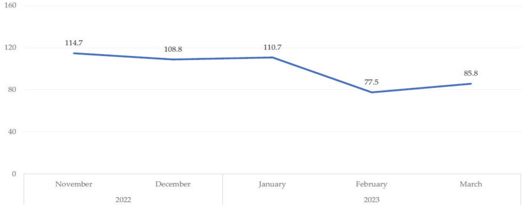
Average Total Severity