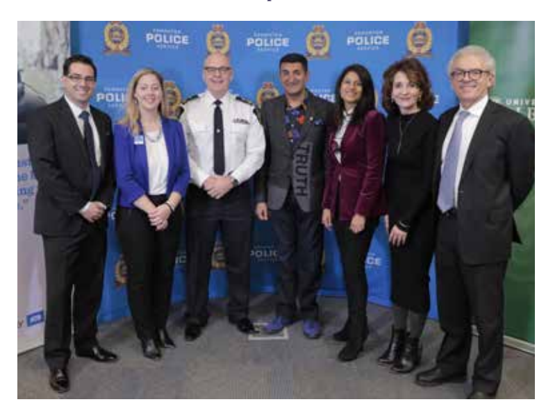
The CSA is made possible by EPF and partnerships with Motorola Solutions, Telus, ATB Financial and the University of Alberta.

The CSA consists of two distinct sections: one side, governed by EPF, concentrates on issuing public challenges that calls on the ingenuity of entrepreneurs for innovative solutions, while the other side, guided by EPS, focuses on data and research. Through stewardship of the EPF, the CSA calls on entrepreneurship and corporate partners to make Edmonton and Alberta a safer place.