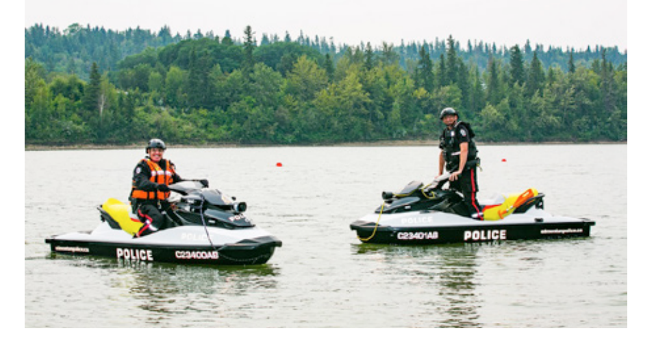
The Marine Unit helped kick off national Water Safety Week on June 2 to encourage safe boating this summer.

Proactive patrol time focuses on crime prevention, intervention and suppression activities, such as searching for an individual with outstanding criminal warrants, conducting traffic stops, and patrolling a known crime hot spot. Proactive time has been low for several years due to rising dispatch call volume that patrol members must prioritize.