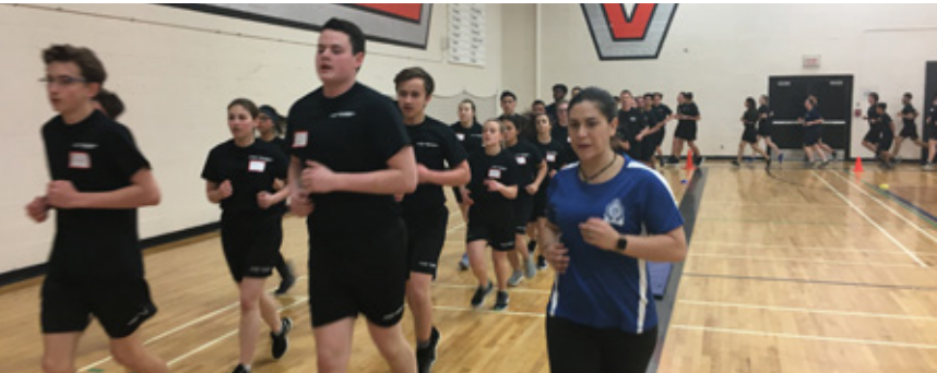
The teens experienced the challenges of police training, and demonstrated the character, enthusiasm, and teamwork necessary to succeed.

On January 1, 2019, south Edmonton grew significantly as a result of the newly approved annexation of areas of Leduc County.