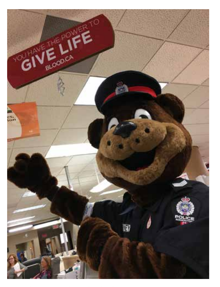
Barney the Bear is ready to roll up his sleeve and donate blood on behalf of the EPS.

Every summer, Canadian Blood Services runs the Sirens for Life challenge nationwide in July and August to save lives in hospitals to ensure its blood inventory doesn't fall short. The campaign is a blood donor challenge between local fire, police and paramedic services.